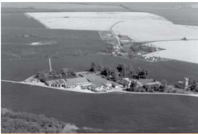
AERIAL PHOTOGRAPH OF COCKAYNE HATLEY

A Parish Plan for Wrestlingworth and Cockayne Hatley, based on the views of residents, can help make a difference to the future of the villages. It sets out villagers' priorities and concerns. In particular it will inform democratically the Parish Council and other bodies about residents' wishes so that decisions can be based on reliable and widely understood information.