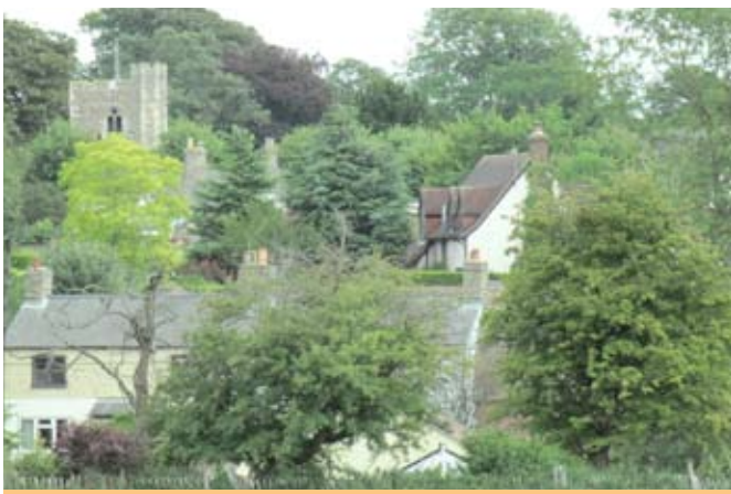
VIEW TOWARDS ST PETER'S CHURCH, WRESTLINGWORTH

The Parish Plan started as a 'Potton Liaison' joint exercise with Wrestlingworth and Cockayne Hatley, Sutton, Everton, Dunton and Eyeworth in around 2005. In those early days many meetings were attended in Eyeworth Village Hall but little progress was made. The Wrestlingworth and Cockayne Hatley group became very frustrated and recommended to the Parish Council that we should go it alone, based on the feeling that other villages didn't share the same vision and it was unlikely that any questionnaire would be localised enough to deal with our issues.