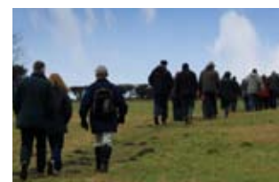
THE ENVIRONMENT AROUND COCKAYNE HATLEY IN 2011