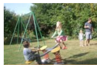
BELOW: TWO VIEWS OF THE CHILDREN’S PLAY AREA IN WRESTLINGWORTH