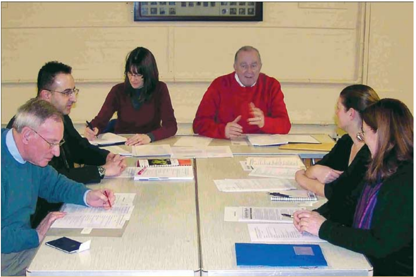
THE PARISH COUNCIL AT WORK IN 2011