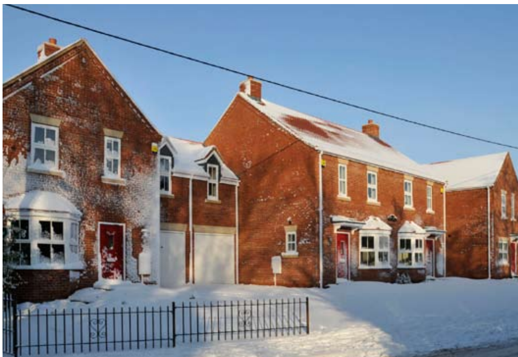
TOP: CHILDREN AT WRESTLINGWORTH SCHOOL IN 1955