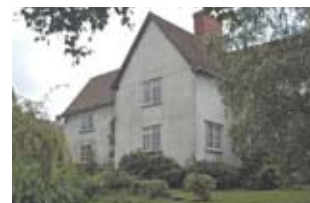
ONE OF THE OLDEST HOUSES IN WRESTLINGWORTH