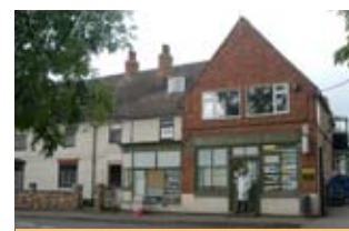
LOWER: ONE OF THE OUTCOMES OF THE WRESTLINGWORTH TIDY UP IN MARCH 2011