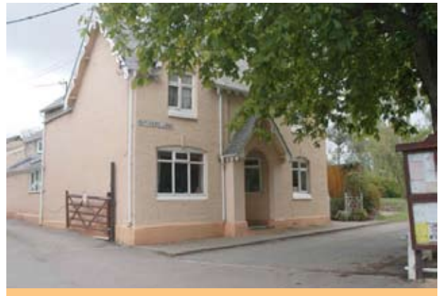
THE OLD BUTCHER'S SHOP AS A HOUSE IN 2002