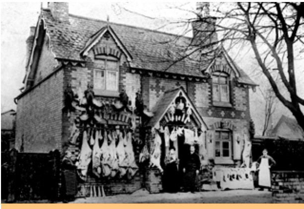
THE OLD BUTCHER'S SHOP WRESTLINGWORTH IN 1898