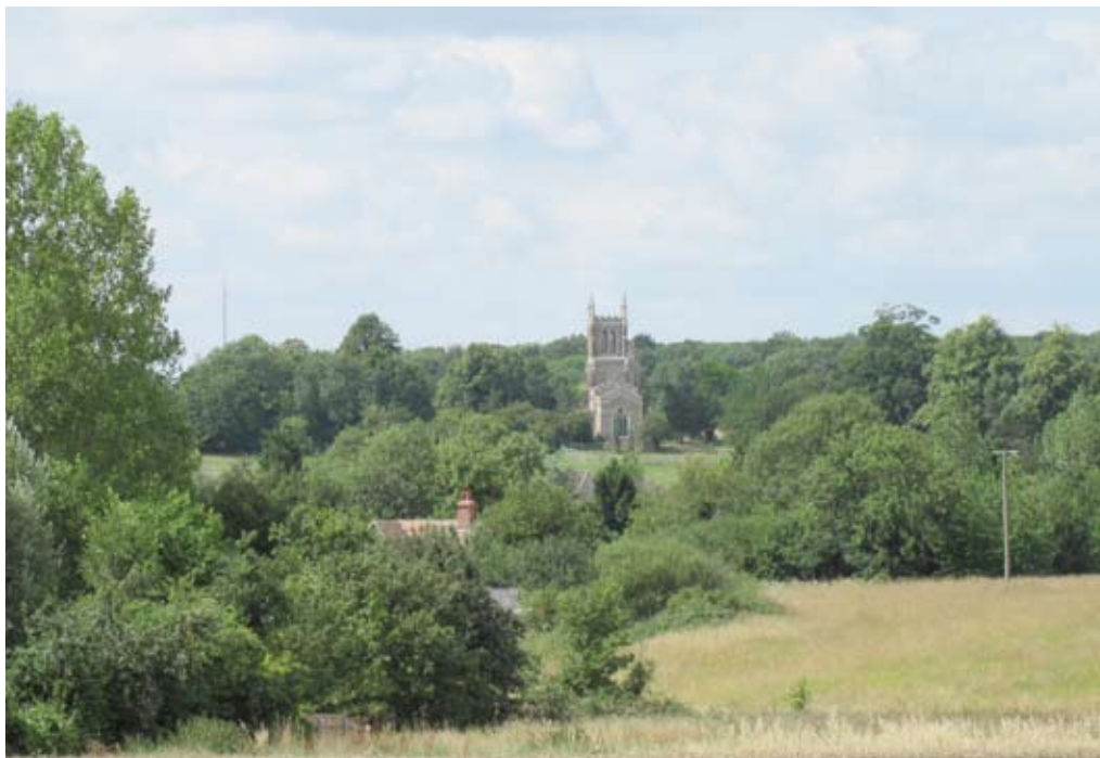
TOP: THE CLOPTON WAY SIGN AT COCKAYNE HATLEY