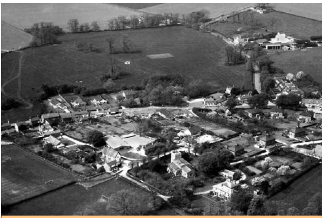
AERIAL PHOTOGRAPH OF WRESTLINGWORTH